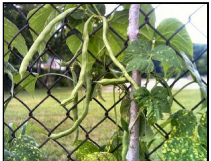
Green beans ( http://mrg.bz/vGrhGb )