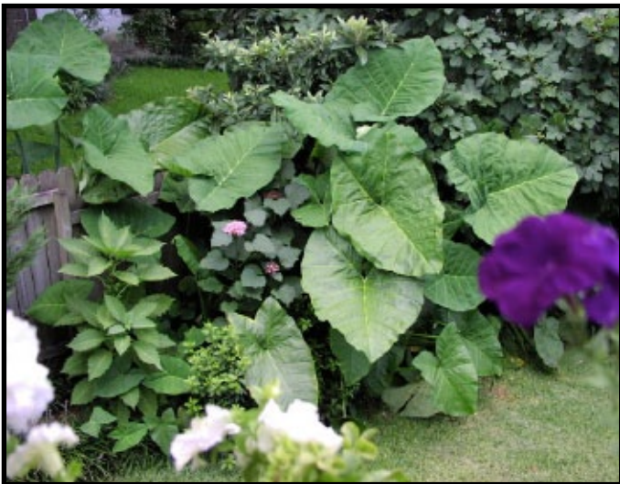
Giant elephant ears