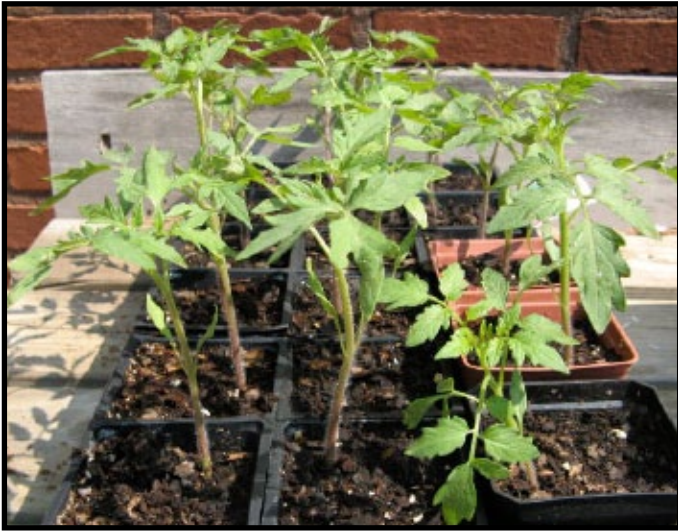
Tomato seedlings ( http://mrg.bz/0aOYBb )