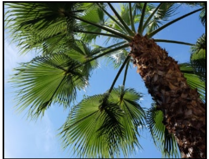
Palm tree ( http://mrg.bz/rS403A )