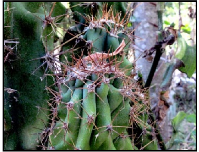
Prickles ( http://mrg.bz/2IPf5R )